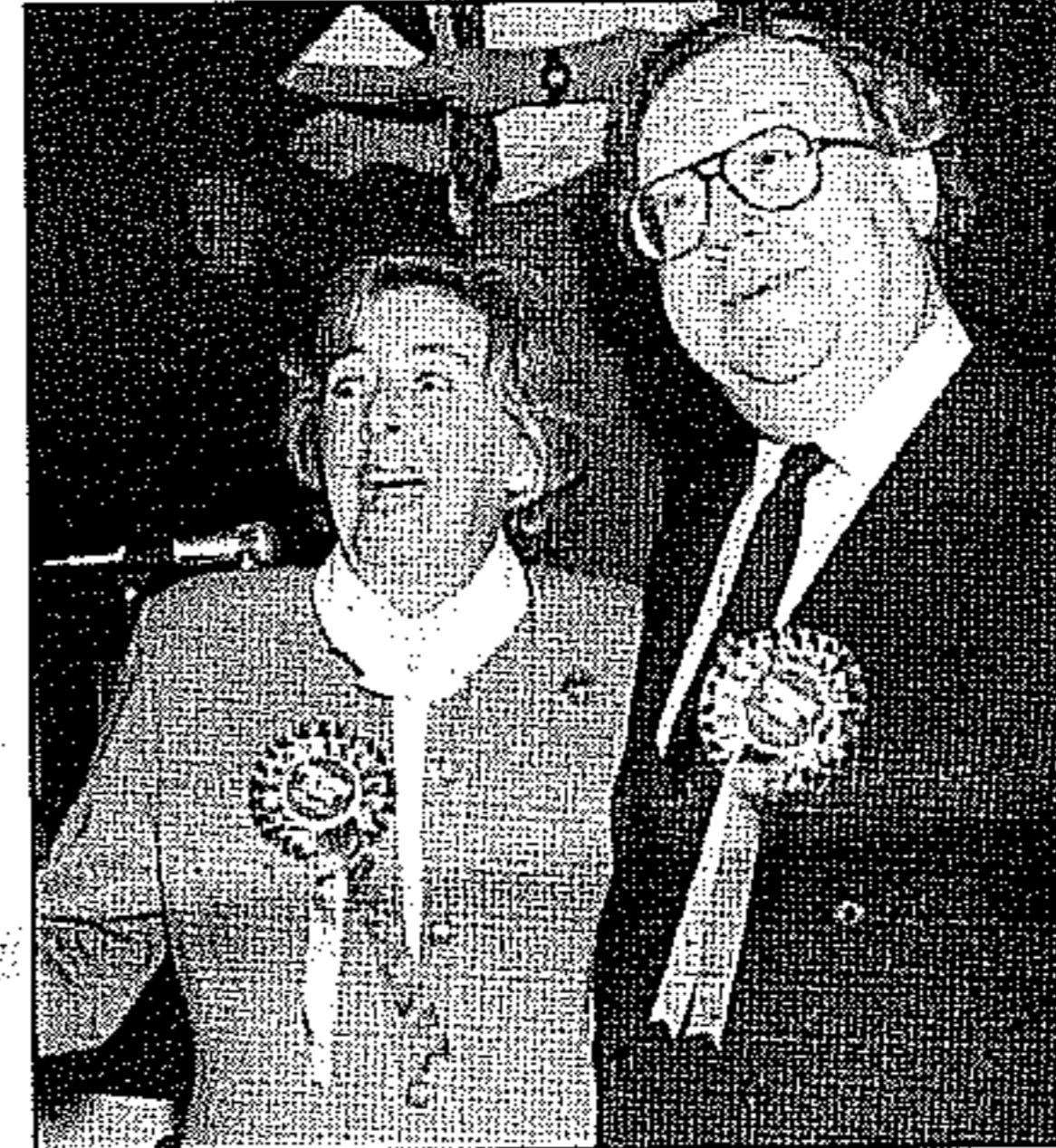
Celebrating after holding his constituency