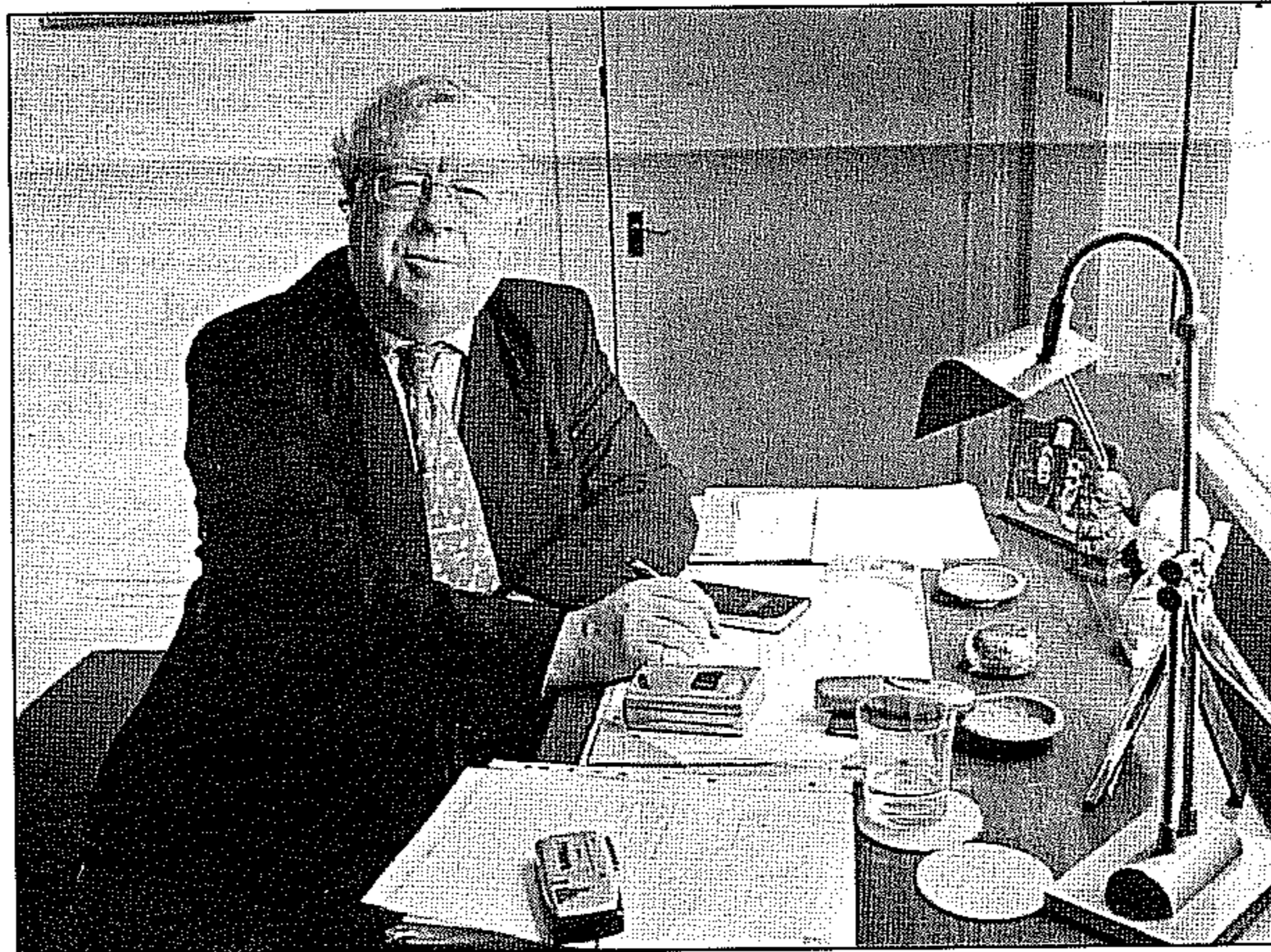
Members are being asked to vote on the future of Sir Patrick Cormack

He explained: "I was shocked. I do not recall the precise words I used in the heat of the moment but they probably indicated I was determined to give the people of this constituency the opportunity to select me once again - and it would have been rea-